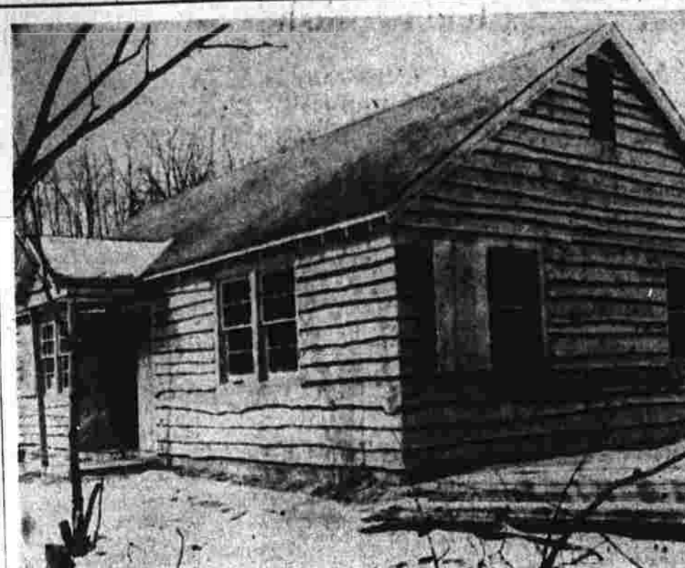
Above is Boy Scout cabin at Camp Johnson, Bolton, now the home camp site of the Manchester troops and Cubs. It was erected by voluntary aid and with funds received in last year's fund drive.